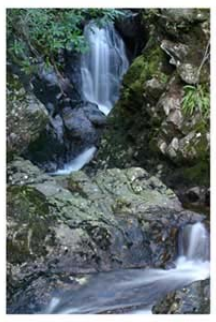
Tighnabruaich and the Waverley

Welcome to our new on-line booking service and improved web site. We really hope that you like it and find the additional features a help. Being able to check the availability of a property at the touch of a button has proved a boon and we are getting lots of useful feedback from the bookings page which, in turn, helps us improve the simplicity of booking your holiday for you so please, do keep filling in all the boxes! We are still here at the end of the phone if you prefer so please do not hesitate to call on 01700 811464.