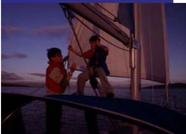
Fun in The Kyles