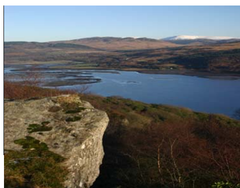
December from the view point