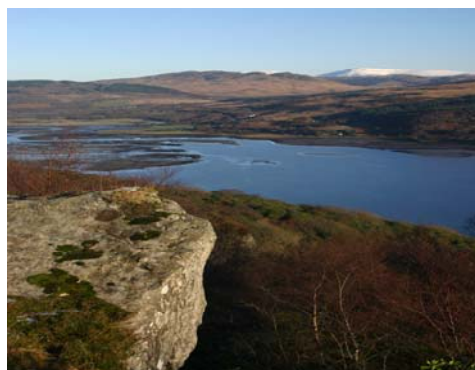
December from the view point

Many of you only visit The Kyles in the summer season but it is worth knowing that off season is, to many, the best season for views and walking etc. We do not get hard winters thanks to the Gulf Stream, Midges are sleeping and the views are fantastic with lovely rich red sunsets making ideal walking conditions. I love photography and the best time is off season particularly the Autumn and late Winter to early spring. The colours are amazing and with ever green trees, there is not that bleak winter you get in most places. You may not want to go sailing but I can assure you some folk do, never a weekend goes past without a sailing boat going by, but walking is a great pastime in the winter. The area has recently re-opened many walks including The Cowal Way and continues to upgrade and open new walks. For more information on our weekend breaks call us on 01700 811464